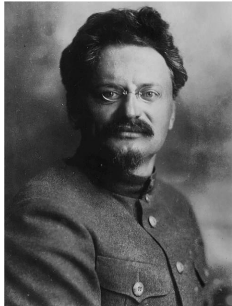
Leon Trotsky People's Commissar for Military and Naval Affairs of the Soviet Union

“You may not be interested in war, but war is interested in you”