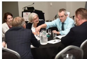
Roundtable discussion in full flow